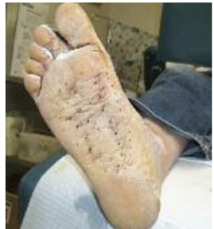
Botox is injected to control superfluous sweating in the foot

graded by the body. However, response has been very positive. Patients report the effects lasting from 6 to 15 months. Ninety-one percent of patients experience a decrease in sweating and odor. Although the initial consultation is covered by most insurance companies, the procedure is not. Treatment can range from $1200 to $1800 for both feet. For more information about the use of Botox for treating excessive sweat, visit these websites www.Botox.com , www.GreatFootCare.com , and www.LIFootCare.com . IMAGE